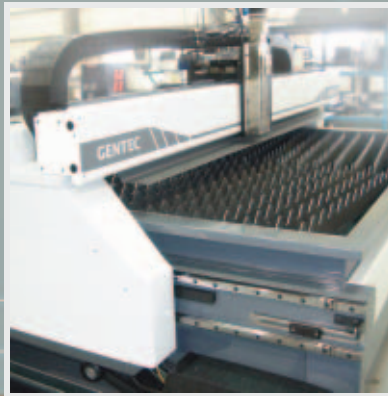
Preloaded double linear way on X & Y axis