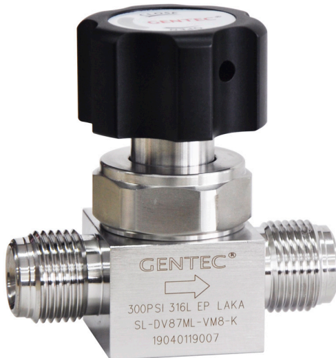
Manual 300 psi

GENTEC® DV87 series ultra-high purity diaphragm valves are designed for the semiconductor industry for low pressure, high flow, ultra-high purity piping systems.