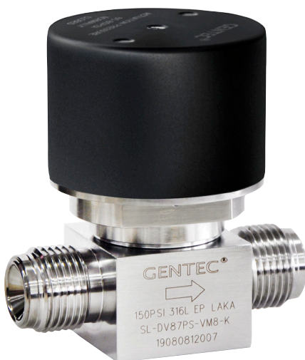
Pneumatic 150 psi